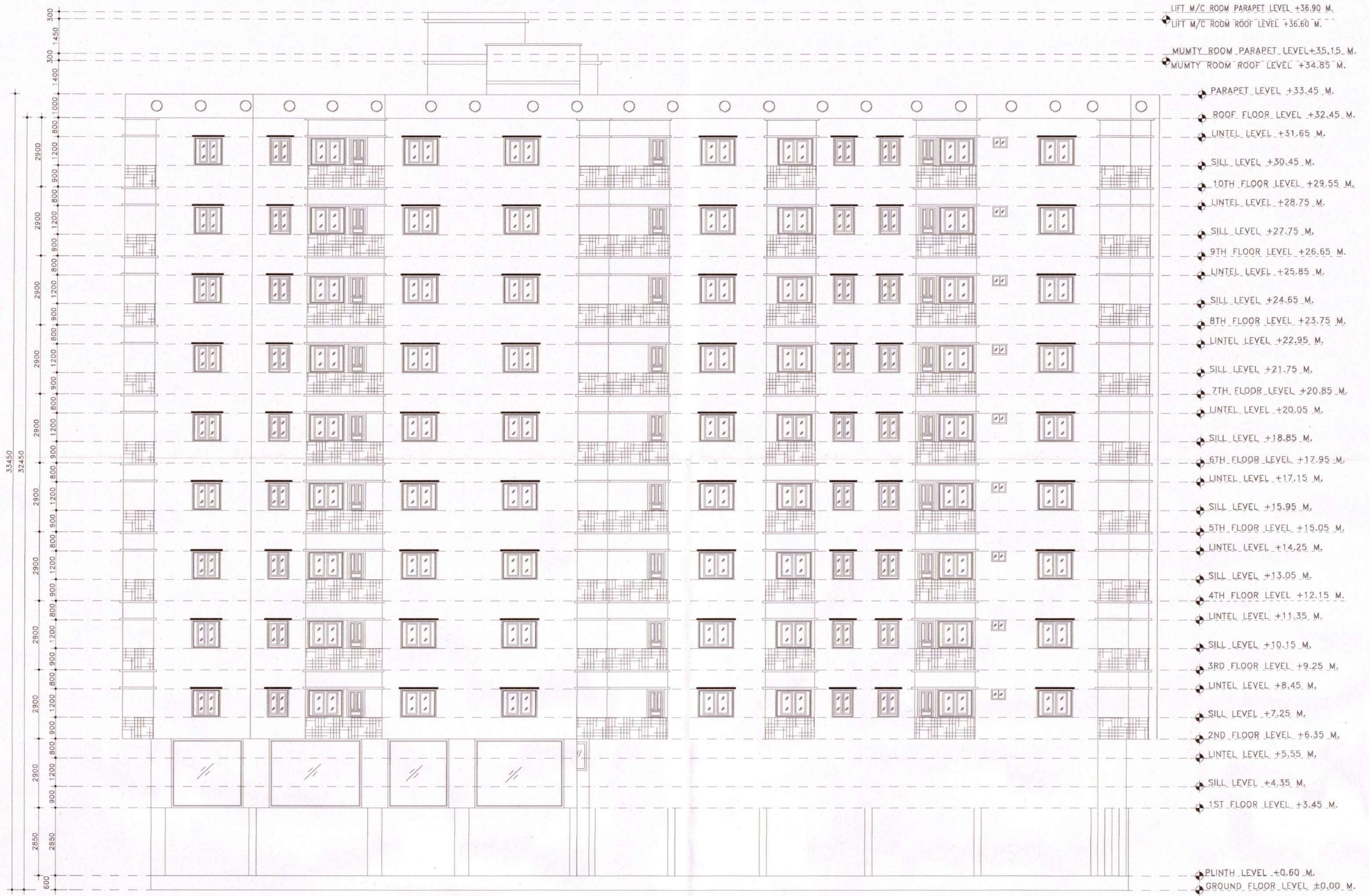
A FRONT SIDE ELEVATION SCALE: 1:100